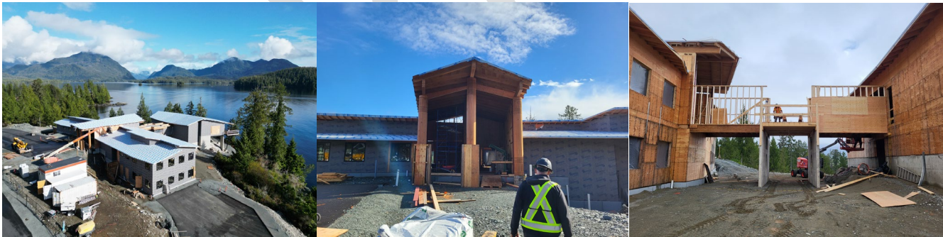
Government Building Progress Nov 2025 1