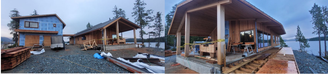
taayii ḥawit House Progress Nov 2025 1