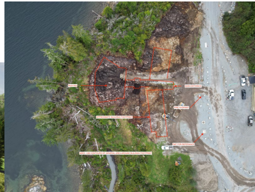
Aerial view of planned location