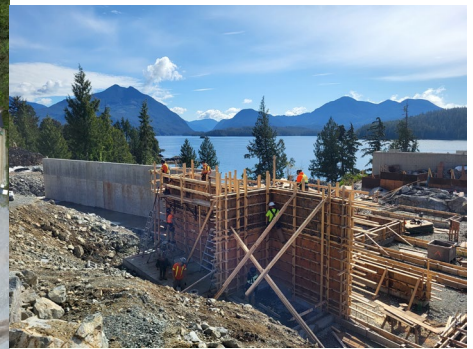
Construction progress May 2025