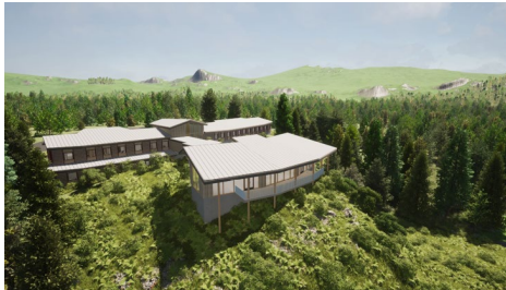
TN Government building rendering