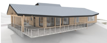
taayii ḥawit House (B21)